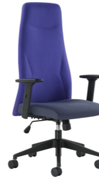
U17H-NH1- M21B215-73A-R2 EXECUTIVE HIGH BACK SYNCHRON CHAIR WITH ADJUSTABLE ARMREST

W : Overall Width D : Overall Depth H : Overall Height SW : Seat Width SD : Seat Depth SH : Seat Height BW : Base Width AW : Armrest Inner Width