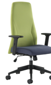
U17M-NH1- M21B215-73A-R2 EXECUTIVE MID BACK SYNCHRON CHAIR WITH ADJUSTABLE ARMREST

H 1190-1290 W 660 D 630 SH 435-535 SW 490 SD 465 BW 660 AW 490