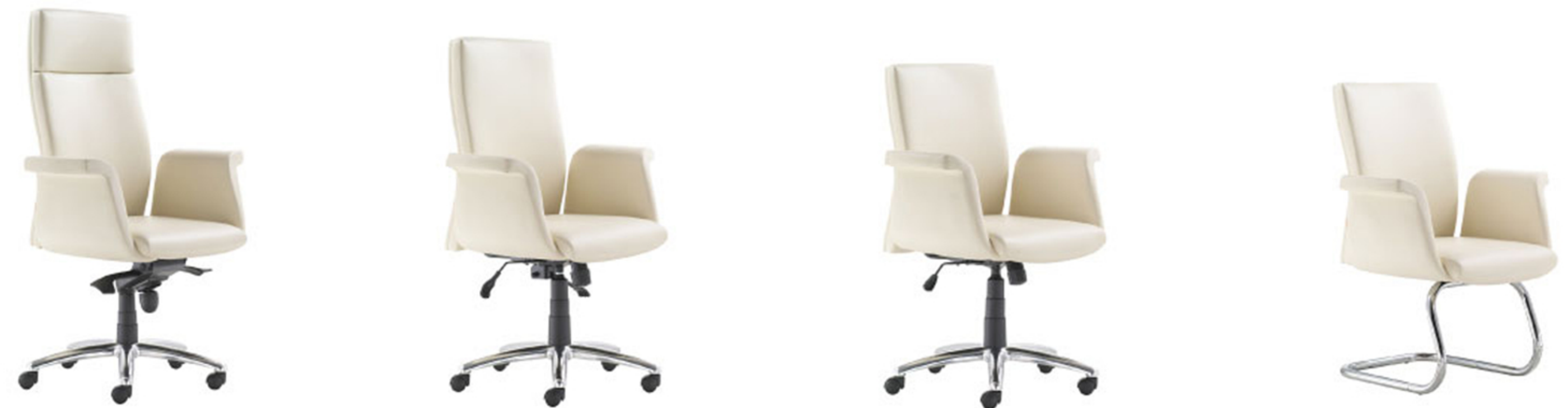
U5H-BC3-M55B76-R1 PRESIDENTIAL HIGH BACK SYNCHRON CHAIR

H 1215-1280 W 790 D 695 SH 455 SW 495 SD 520 BW 670