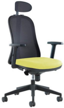
U20H-NH1-M7-130A-R2-MS33 PRESIDENTIAL HIGH BACK HEAVY DUTY SYNCHRON CHAIR with adjustable armrest

H 1150-1250 W 655 D 670 SH 450-550 SW 500 SD 460 BW 660 AW 490