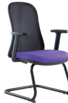
U20V-CE42-132A-R2-MS33 VISITOR MID BACK CHAIR with fixed armrest

H 1150-1390 W 655 D 670 SH 550-785 SW 500 SD 460 BW 670 AW 490