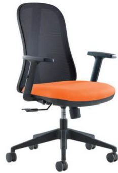
U20M-NH1-M73-130A-R2-MS33 EXECUTIVE MID BACK SYNCHRON CHAIR with adjustable armrest

H 1150-1250 W 655 D 670 SH 450-550 SW 500 SD 460 BW 660 AW 490