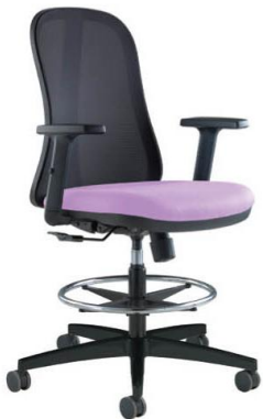
U20MSTS-NH4-M73-130A-R2-DC1-MS33 EXECUTIVE MID BACK SIT-TO-STAND CHAIR with adjustable armrest

W : Overall Width D : Overall Depth H : Overall Height SW : Seat Width SD : Seat Depth SH : Seat Height BW : Base Width AW : Armrest Inner Width