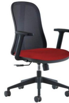
U20M-NH1-M73-132A-R2-MS33 STAFF MID BACK SYNCHRON CHAIR with fixed armrest

H 1000-1100 W 655 D 670 SH 450-550 SW 500 SD 460 BW 660 AW 490