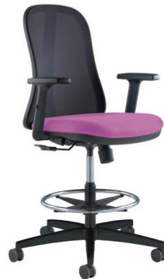
U20MSB-NH4-M73-130A-R2-DC1-MS33 EXECUTIVE MID BACK STOOL CHAIR with adjustable armrest

H 1150-1330 W 655 D 670 SH 480-655 SW 500 SD 460 BW 670 AW 490